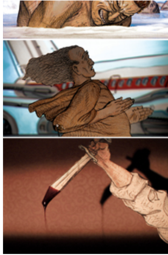
Artwork by Sandow Birk

while the waves move back and forth like those old Vaudeville sets. There's an airport metal detector, where the goons from the TSA advance thuggishly on a hapless old man. There's the shawarma shack in 3-D, while on one wall, the long trailer for the movie runs on a loop. People